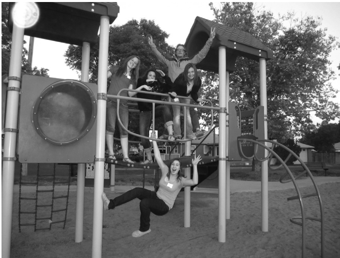
YM's Fall scavenger hunt was a hit