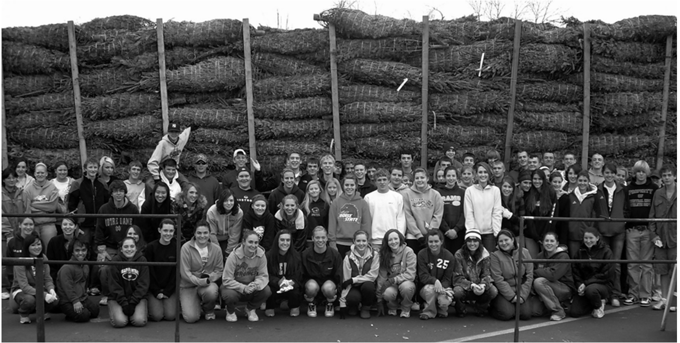
Knights of Columbus Tree Lot is open now!