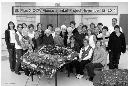
Fleece Project 2011

group started the blanket project five years ago, after seeing a front-page photo in the Billings Gazette that showed a parishioner, whose family had