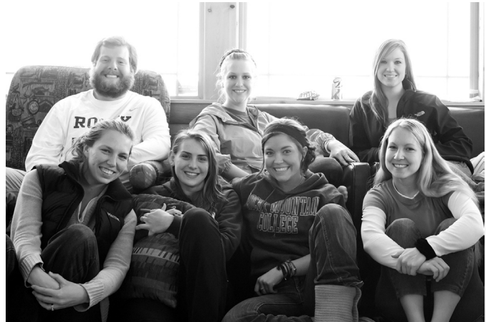
BCCM students from Rocky Mountain College and Montana State University -Billings enjoy their autumn retreat learning about and experiencing JOY in the spiritual life!