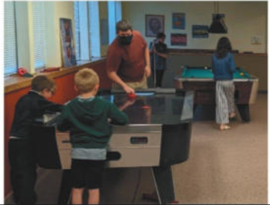
Kids and parents playing games in the youth center.