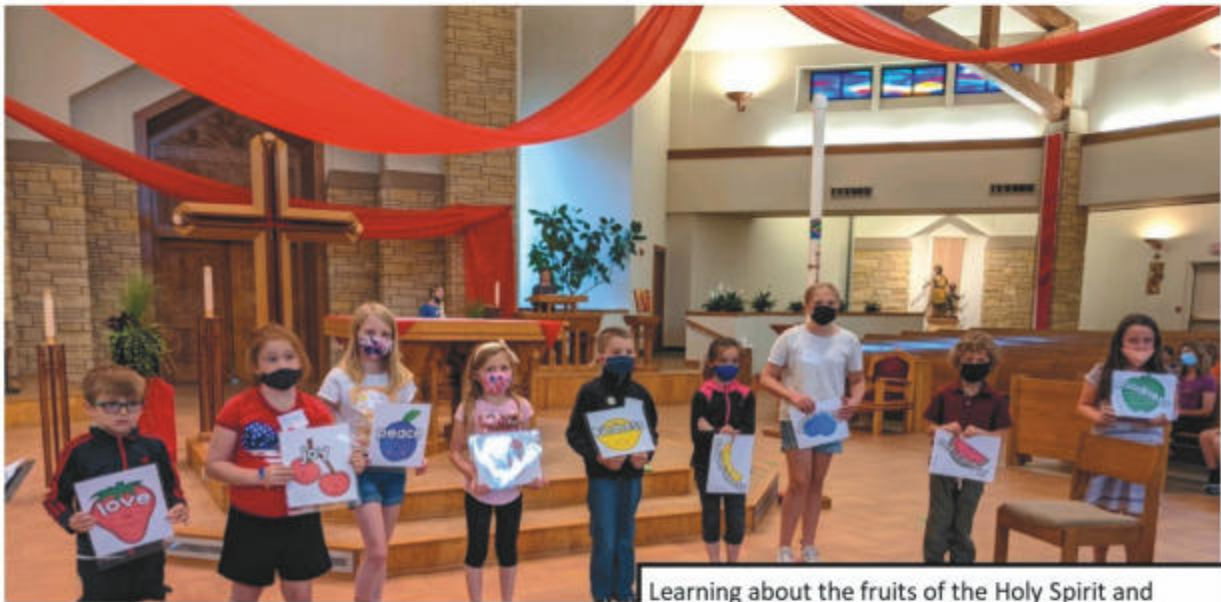
Learning about the fruits of the Holy Spirit and Pentecost in the opening prayer service.