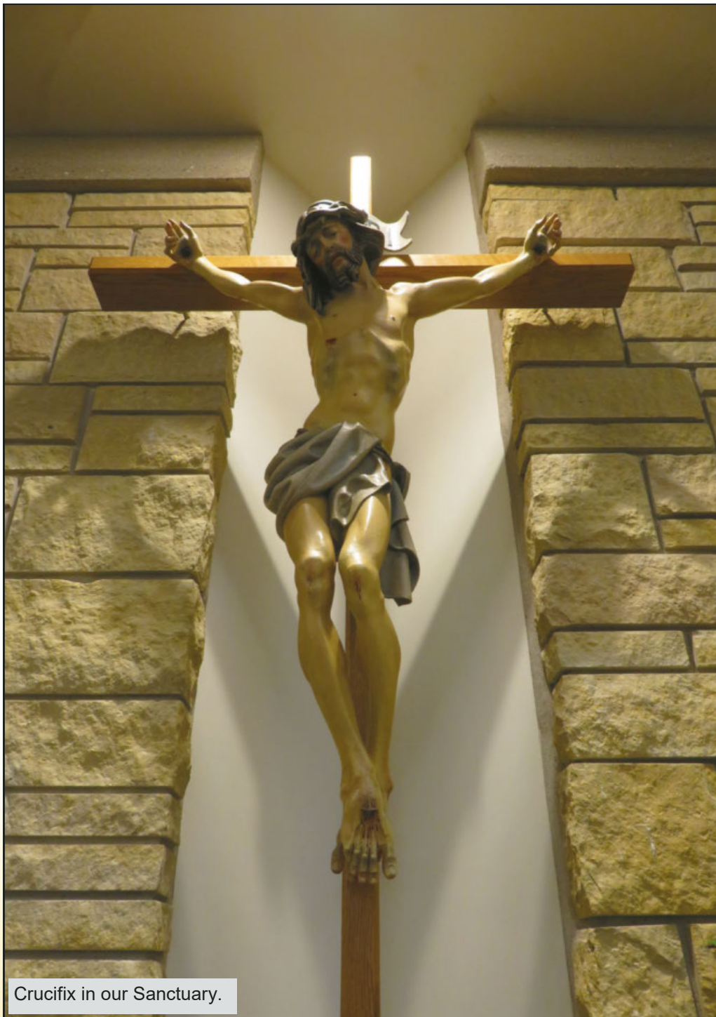
Crucifix in our Sanctuary.