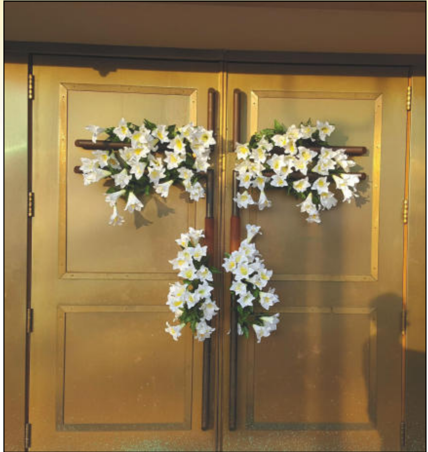
Above: Our church doors welcome Easter parishioners!

The Council of Catholic Women (CCW) asks parishioners to total their loose change collected during the Lenten season and send a check for their almsgiving to St. Pius X CCW , 717 18th St. West, Billings, MT 59102. Or drop it by the parish office soon after Easter. Please note that this annual fund raiser allows CCW to donate to "Water for Life", the Madonna Plan and locally, to LaVie. CCW thanks all for their prayerful giving to these worthwhile projects.